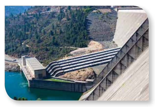
HYDROPOWER PLANT, SHASTA DAM

California has a bias toward trying new things – introducing change through executive initiatives, legislation, referendum, and evolving regulations. In many ways, this is consistent with California's deep "innovation culture" that includes not only Silicon Valley, but also many other communities within the state. Over the years, California and its many strong universities have attracted a hub of investors and talent that fosters further investment and innovation. In the policy arena, administrative and enforcement responsibilities for state programs that affect the energy sector cut across numerous state offices, agencies, and commissions, and responsibilities for program design and execution happen across many levels of government – from the key agencies of the state government's executive branch, to regional and county government entities, right down to town/local offices.