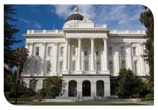
STATE CAPITOL BUILDING, SACRAMENTO

Against this backdrop, California has also launched the biggest policy experiment affecting energy choices to date: a multi-sector cap on greenhouse gas (GHG) emissions in the state. This policy – known as AB 32, after its authorizing legislation – will impose significant compliance requirements on countless firms and organizations but will also generate large sums of revenues for state and utility use. On top of this, California will soon begin to implement Proposition 39, a recently passed ballot initiative that will generate additional large sums of money for energy-related investments.