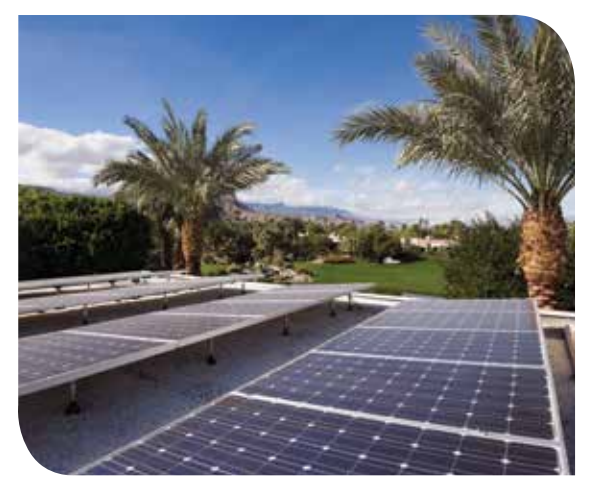
SOLAR PANELS, INDIAN WELLS

On behalf of the Advanced Energy Economy Institute, the Analysis Group team interviewed 30 CEOs and senior executives from advanced energy companies located in and/or doing significant business in California. Starting with a list of hundreds of such companies, we selected a set designed to reflect the breadth of businesses involved in advanced energy activities. Thus, the companies were involved in different advanced energy business sectors: electricity generation, transportation, buildings, transport and non-transport fuel production, electricity delivery and management, fuel delivery, and industry.