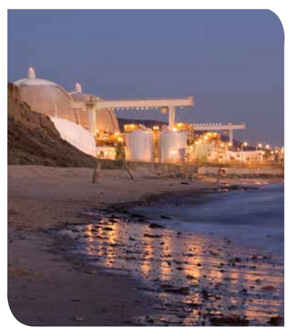
SAN ONOFRE NUCLEAR GENERATING STATION

— CEO of advanced energy start-up company producing alternative fuels